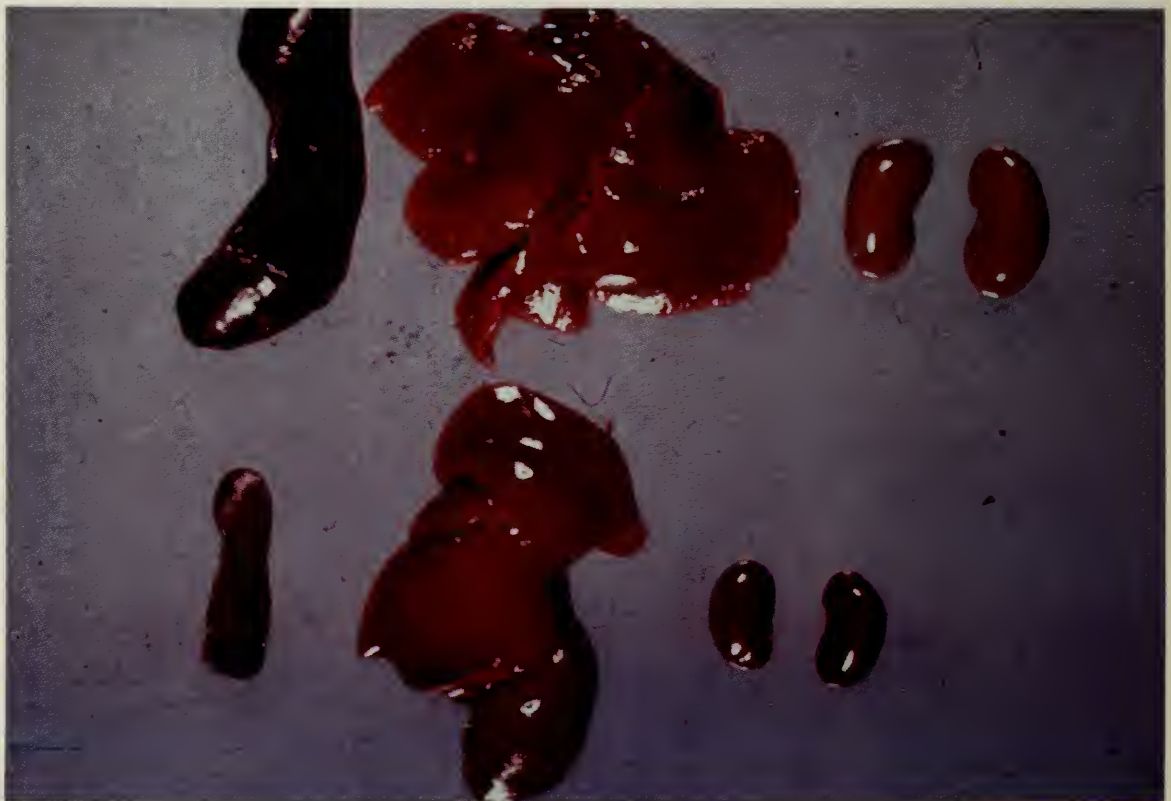
Fig. 4. Aleutian disease — L to R : spleen, liver, kidneys; top , infected; bottom , normal.